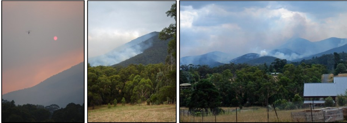
Figure 125. Black Saturday bush fire as seen from our Healesville property about two kilometers (1.2 miles) away.

added to the fire severity rating scale. Top-down fire management systems were turned upside down, with on-the-ground teams leading local decision making. Soon after these events the Dry turned again to the Wet for the last fourteen years. Now, with dense regrowth vegetation everywhere, we await the next big fire as we enter a new dry period.