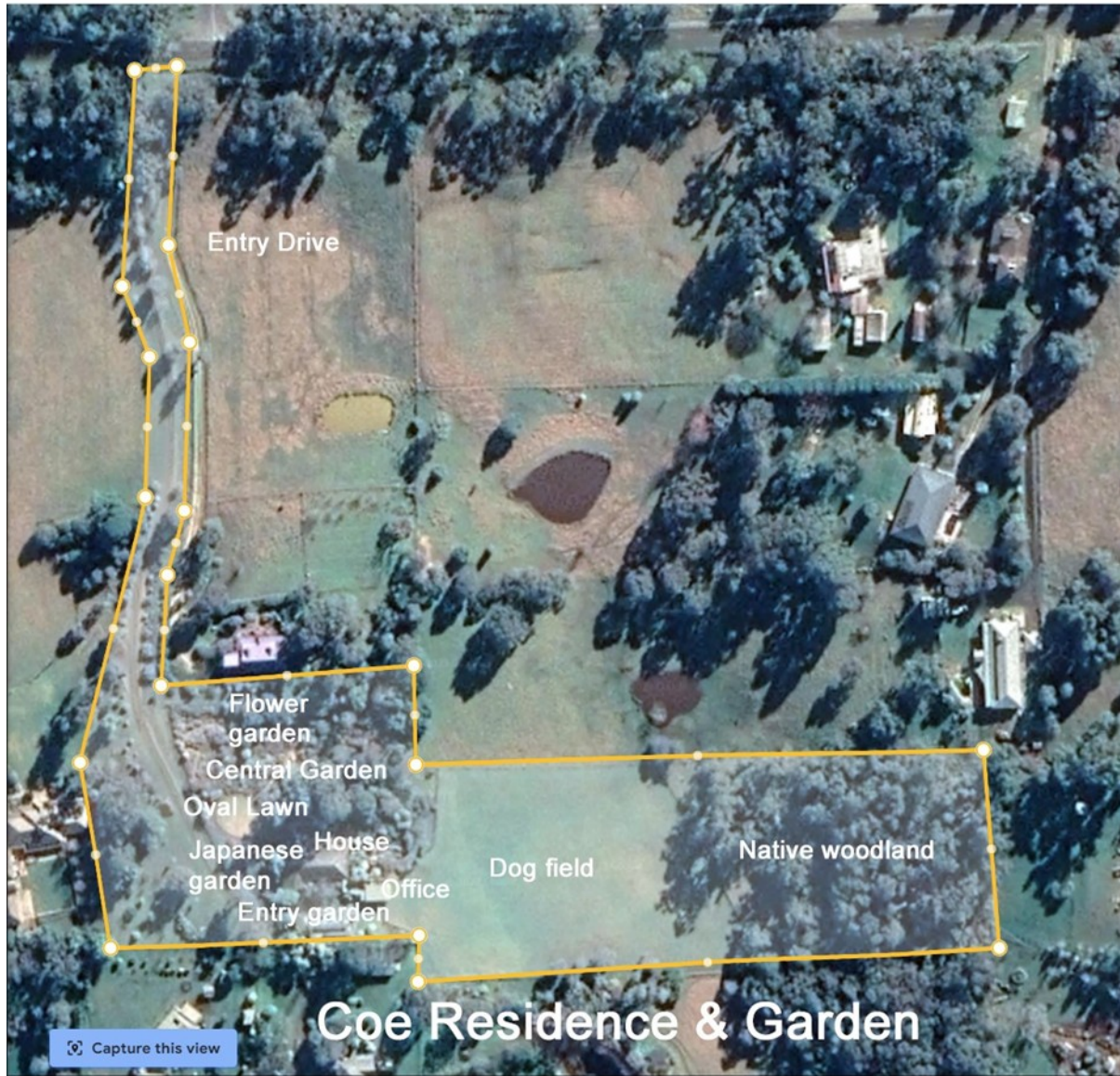
Figure 124. Upper image: property when we purchased it in 1999. Middle image: view of oval lawn in 2022 from about the same area but looking farther to the left, after over twenty years of our design, construction, and maintenance work. Lower image: recent aerial view of our property from Google Earth.