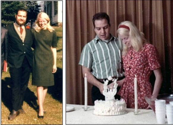
Figure 117. Wedding in Vermont and wedding reception at Susan's parents' home in San Diego 1966. The Peace Corps made me shave off my beard, saying I looked too much like Fidel Castro. I grew it back soon after arriving in Brazil.

Our Wedding. In September 1966 we returned to New England to begin our Peace Core Volunteer training, described in the previous chapter, at the Center for International Studies in rural Brattleboro Vermont. Upon completion of training and being accepted as Peace Core Volunteers, we were married in a quiet ceremony at the Center.